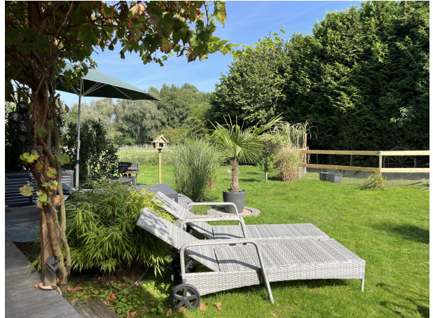
Ruheoase mit Pferden im Garten Wohnung EG rechts