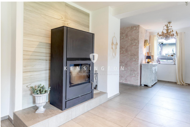
Wohnzimmer Wohnung EG links